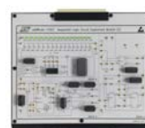
13307 Sequential Logic Circuit Experiment Module (2)