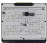
13205 FET Circuit Experiment Module