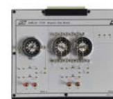
13105 Ampere's Rule Module