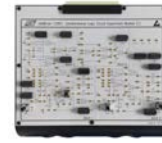
13301 Combinational Logic Circuit Experiment Module (1)