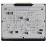
13207 OP Amplifier Circuit Module (2)