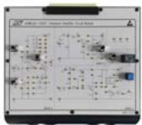
13203 Transistor Amplifier Circuit Module