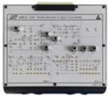
13202 Rectifier, Differential & Integral Circuit Module