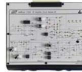
13209 OP Amplifier Circuit Module (4)