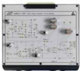
13204 Multi-Stage Amplifier Circuit Module