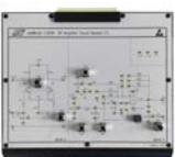
13206 OP Amplifier Circuit Module (1)