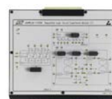
13306 Sequential Logic Circuit Experiment Module (1)