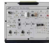
13101 Basic Device Module