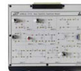
13102 Basic Electricity Experiment Module