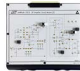
13210 OP Amplifier Circuit Module (5)