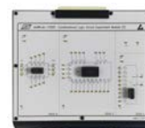
13305 Combinational Logic Circuit Experiment Module (5)