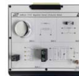
13103 Magnetism Element Introduction Module