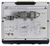
13106 Fleming's Rule Module