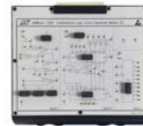
13302 Combinational Logic Circuit Experiment Module (2)