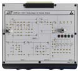
13201 Diode, Clipper & Clamper Module