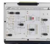
13303 Combinational Logic Circuit Experiment Module (3)