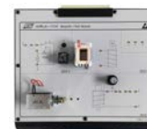
13104 Magnetic Field Module