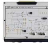
13208 OP Amplifier Circuit Module (3)