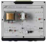
13107 Electromagnetic Induction