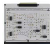
13304 Combinational Logic Circuit Experiment Module (4)